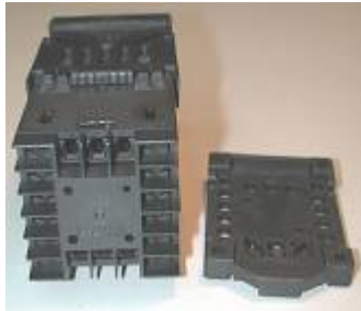
Snap on option

This option is specified as part of the unit's part number and is shown on the last component of the part number matrix, codes 2 or 3. Code 3 includes optional splash proof IP65 [Nema 4x].